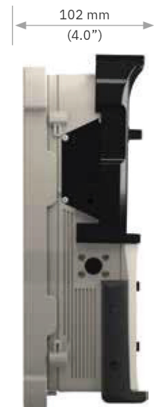
RANGE-R 2D LINK SYSTEM Side Profile