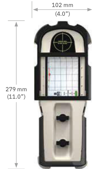
RANGE-R 2D LINK SYSTEM Front Profile